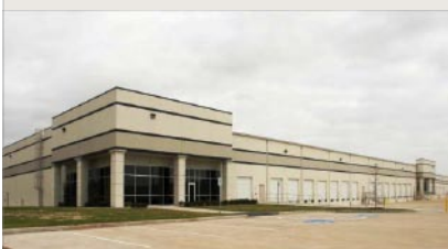
Claypoint Industrial Park, 8830 Clay Road Northwest Corridor